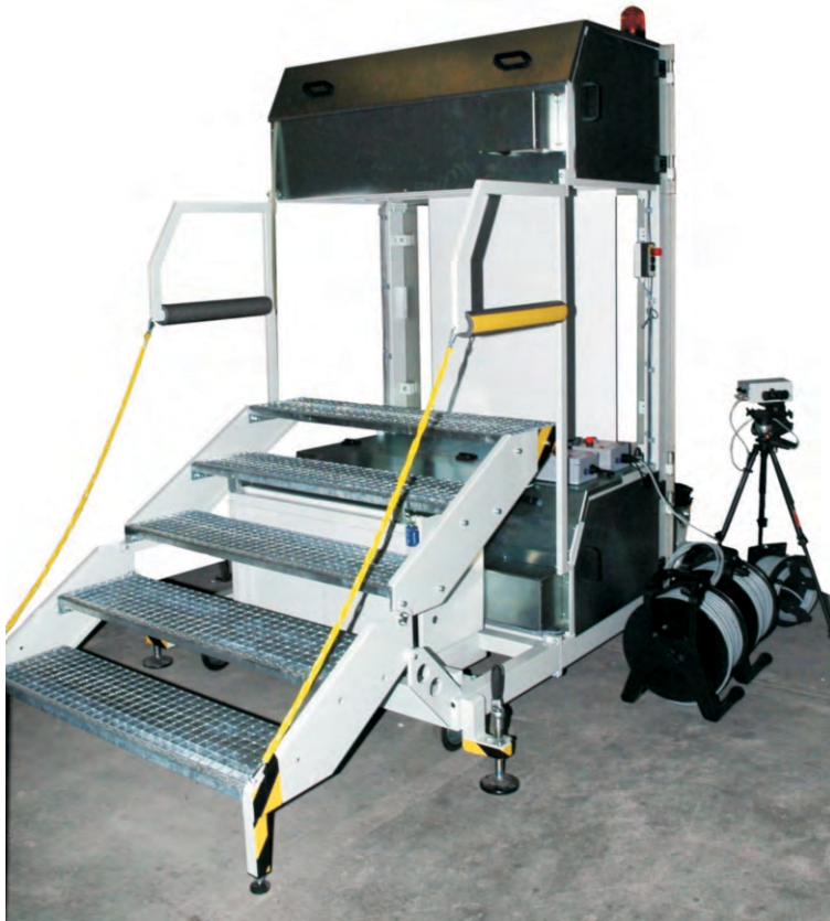
VRT-1 GENERAL VIEW