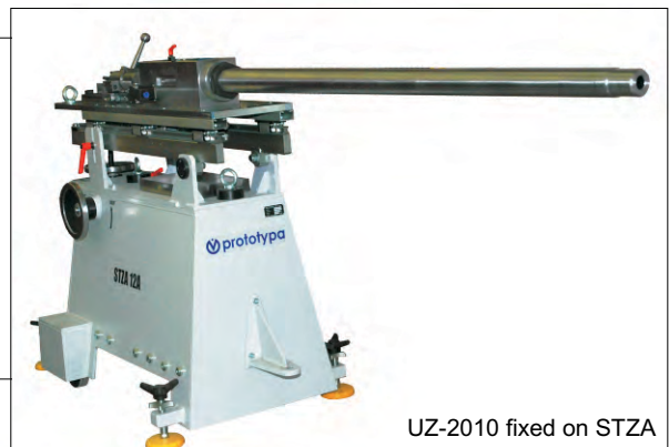
UZ-2010 fixed on STZA