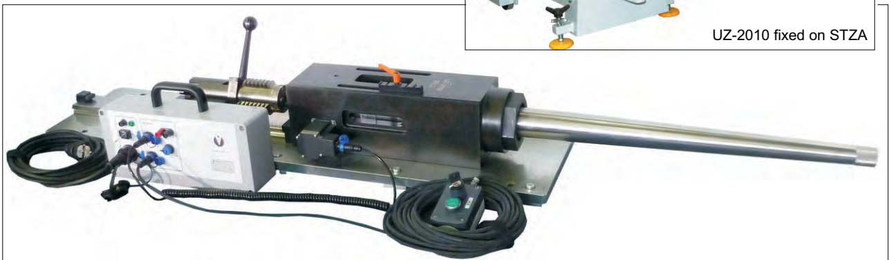
UZ-2010 with Remote fire control