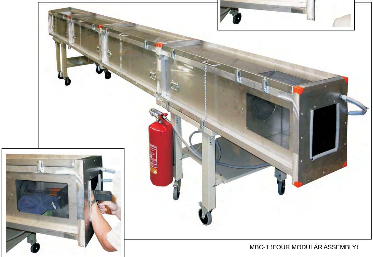
MBC-1 (FOUR MODULAR ASSEMBLY)