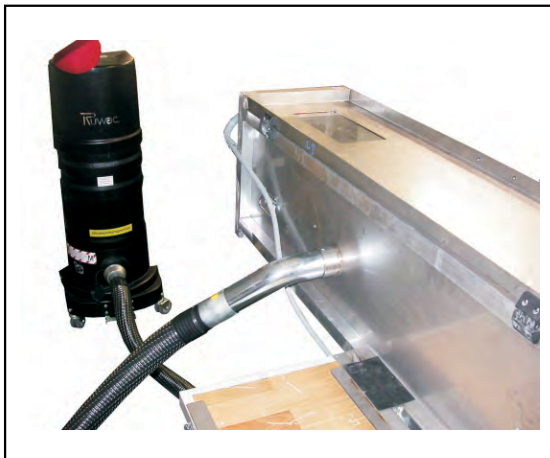
COMBUSTION GAS EXHAUSTING

Width: 825 mm Height - undercarriage included : 1309...1569 mm Length: 6000 mm