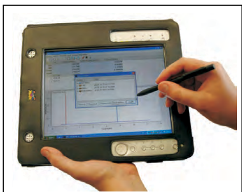
Mobile imaging unit being provided with a contactless display Tablet PC